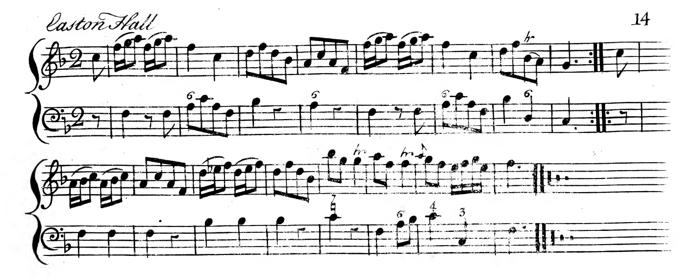
First and 2<sup>d</sup> Man foot it to their Partners & turn them off the Men's Side, then foot it to their Partners & turn them into their Places - Crofs over the whole Figure 'and Hands acrofs quite Round -